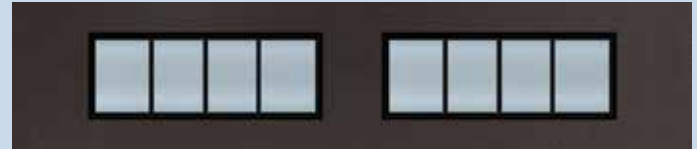
Satin Texture Glass & Provincial Wide Black Muntin Bars

NOTE: Colour representations may not be accurate. Exact colour matches can be requested from a Steel-Craft dealer.