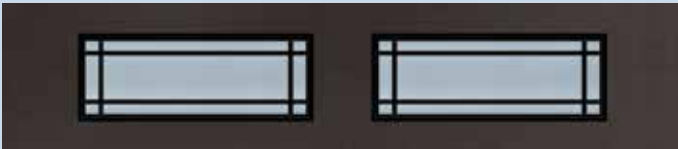
Satin Texture Glass & Regal Wide Black Muntin Bars