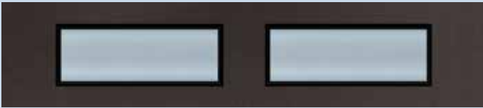
Satin Texture Sealed Glass