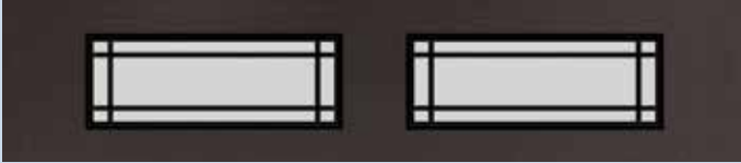
Regal Wide Black Muntin Bars