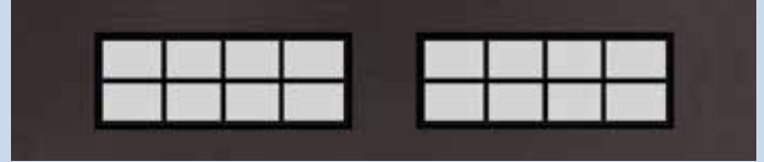
Stanton Wide Black Muntin Bars