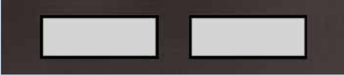
Clear View Sealed Glass